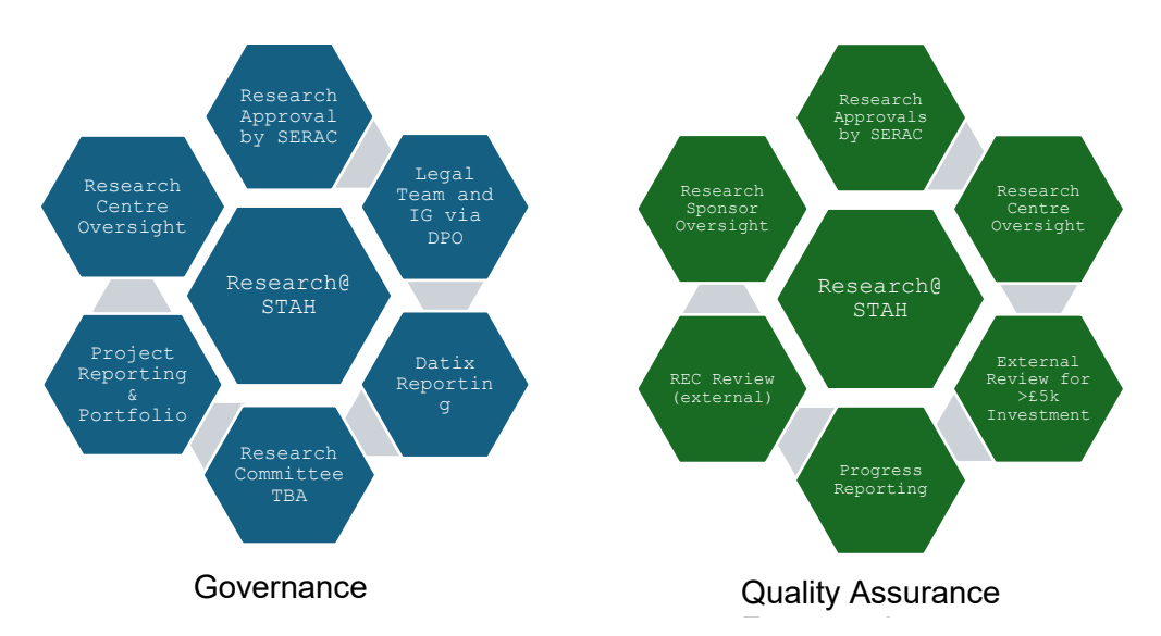
Figure 2: Governance and Quality Assurance Framework