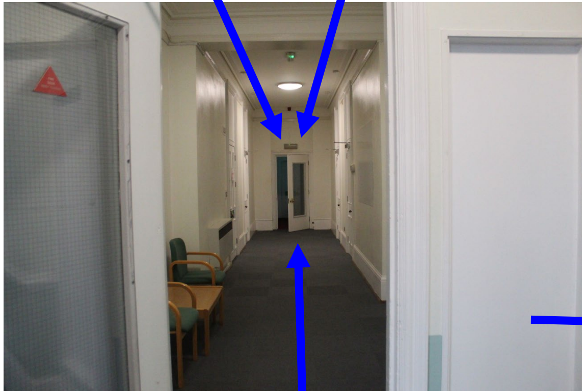
Follow this corridor to the Breakout Area, Toilet and Kitchen